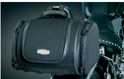
Doesn't Require Luggage Rack when Mounting on Backrest