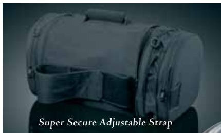
Super Secure Adjustable Strap