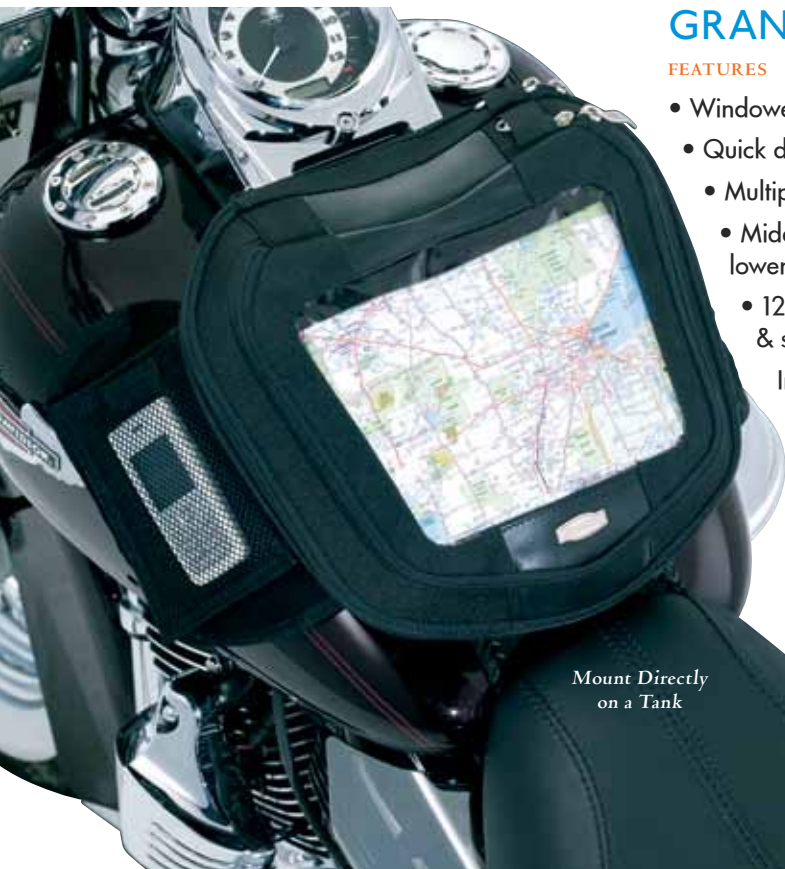
Mount Directly on a Tank