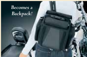
Becomes a Backpack!